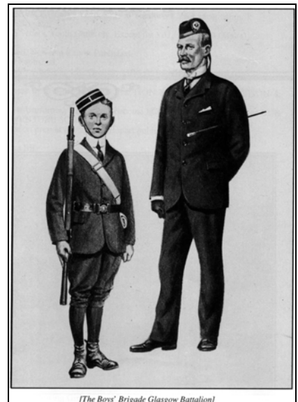
[The Boys' Brigade Glasgow Battalion]