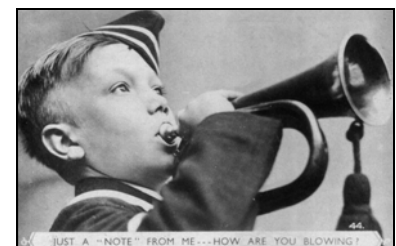
JUST A "NOTE" FROM ME...HOW ARE YOU BLOWING?